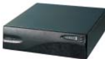
Powerware 5125 rackmount 5000 to 6000 VA