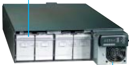
Powerware 5000/6000 VA rackmount model

Hot-swappable electronic modules - replace electronics modules without shutting down connected equipment (available on 2400 VA to 6000 VA models)