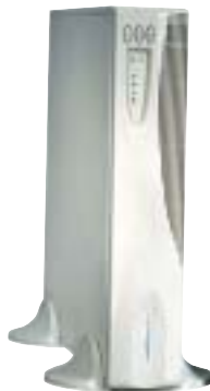
Powerware 5125 two-in-one form factor 1000 to 3000 VA