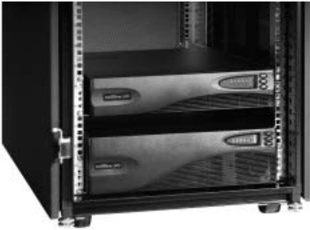
Powerware 5125 2U and 3U rackmount models