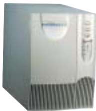
Powerware 5125 tower model 1000 to 2200 VA